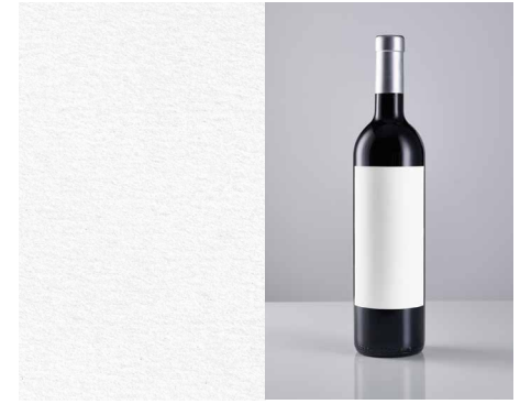
Fasson® Cotton Touch Craft FSC