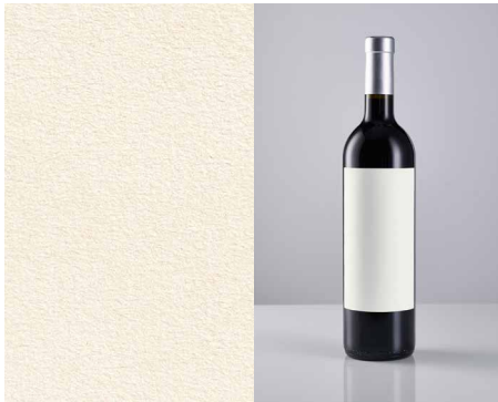
Fasson® Cotton White