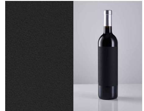
Fasson® Cotton Black