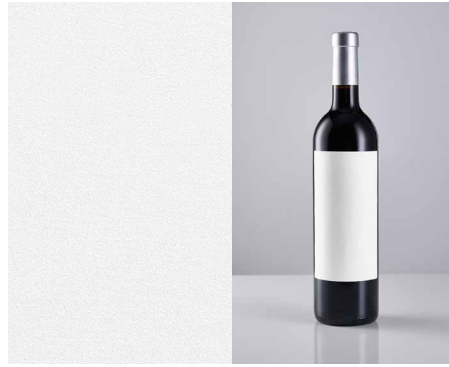
Fasson® Cotton Touch FSC