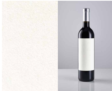
Fasson® Cotton Extra White